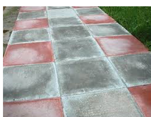
Moisture Lock Gives Pavers an Ugly Appearance