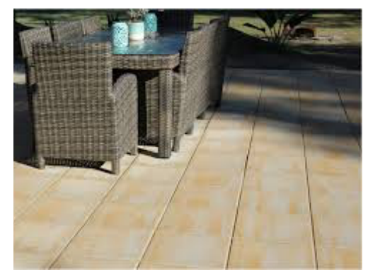
Patchy, Faded & Sealer Turned Yellow