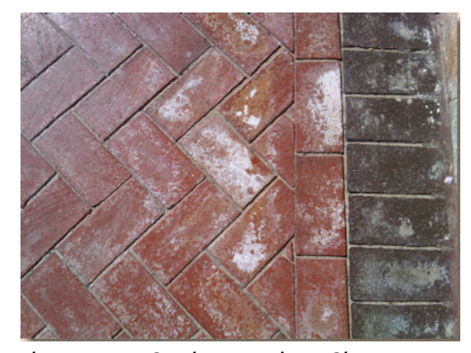
The Wrong Sealer Used on Clay Pavers